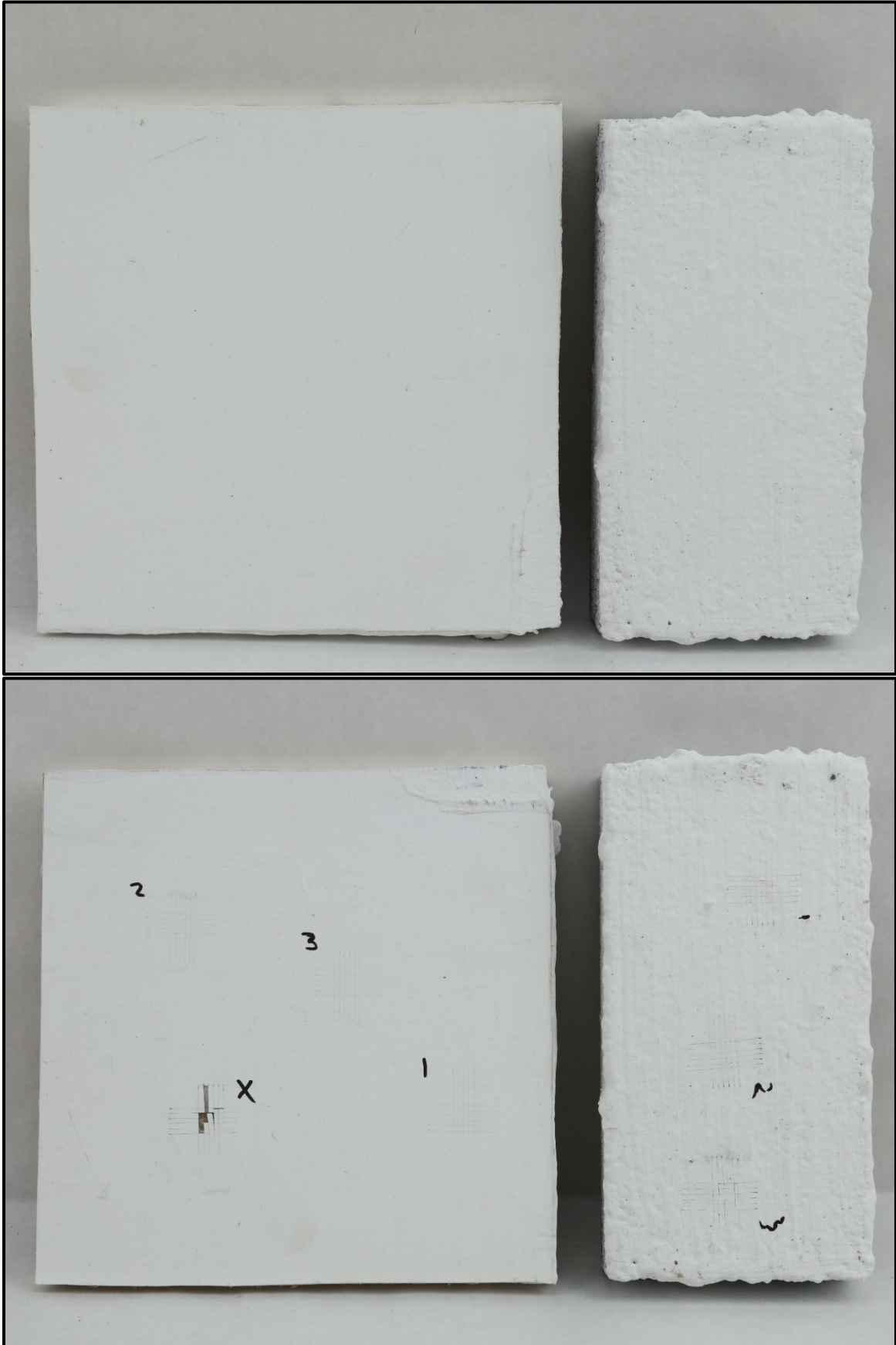
Figure 5: Pre-Exposure & Post Exposure Photographs of Adhesion Test