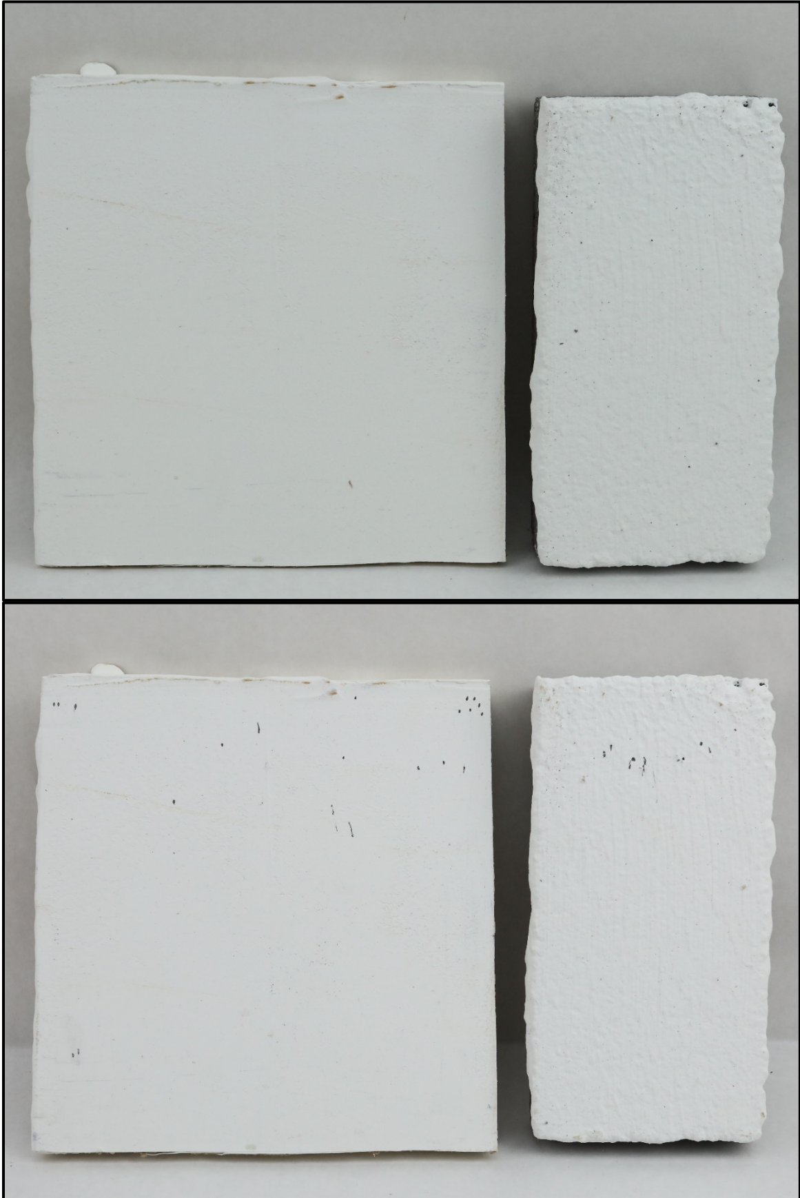
Figure 2: Pre-Exposure & Post Exposure Photographs of Pencil Hardness Test