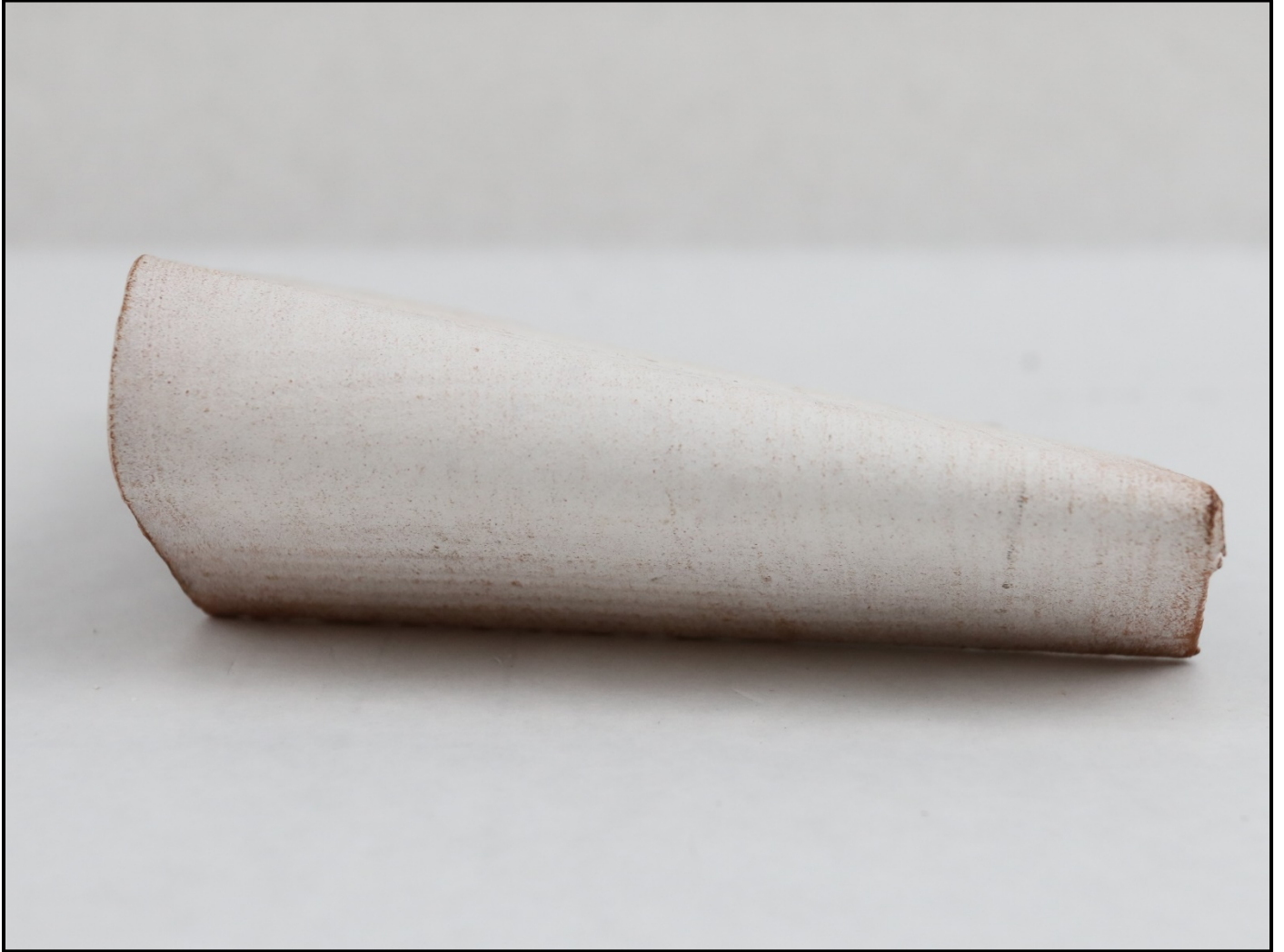
Figure 3: Post Exposure Photograph of Flexibility Test