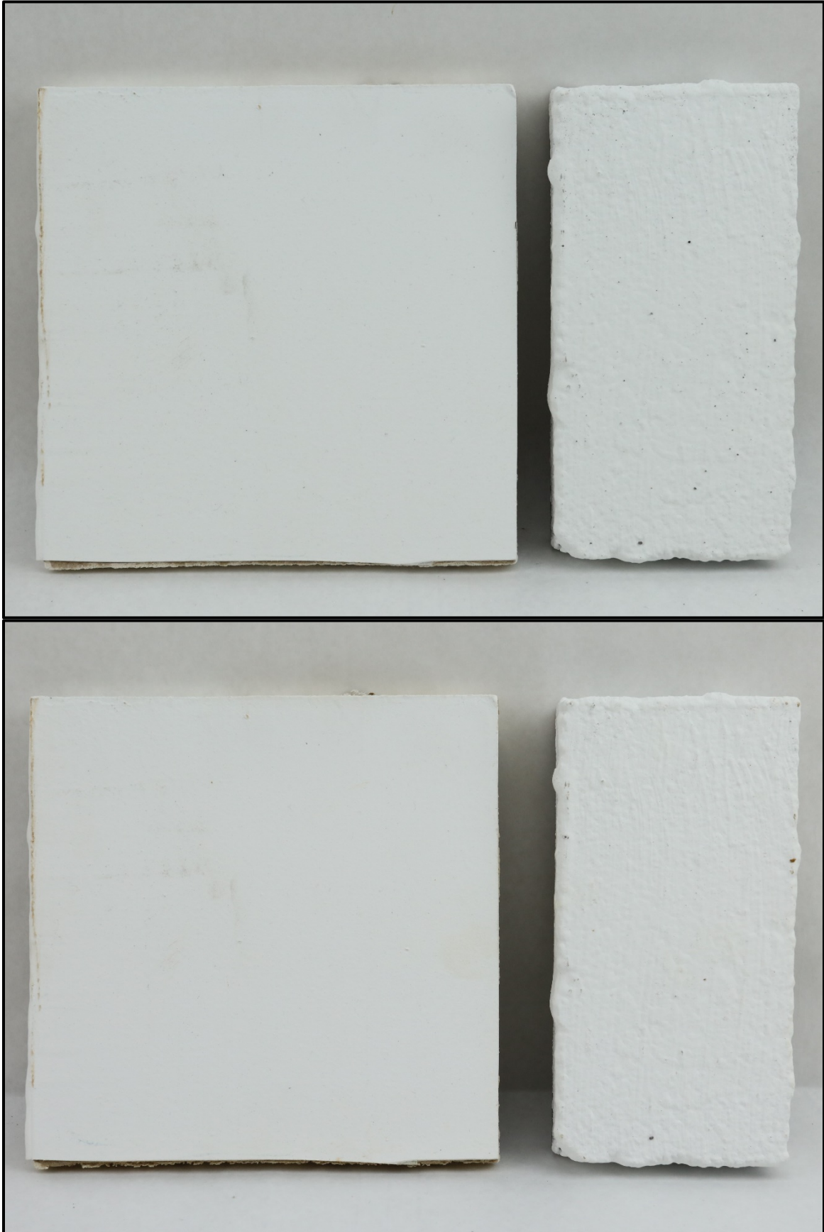
Figure 1: Pre-Exposure & Post Exposure Photographs of Salt Spray Test