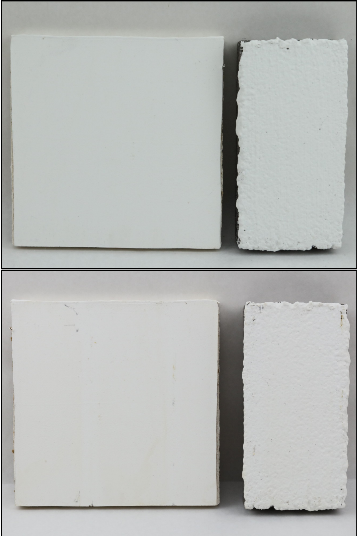
Figure 6: Pre-Exposure & Post Exposure Photographs of Weathering Test